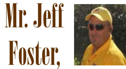
President of Texas Sporting Clays Association, will be the